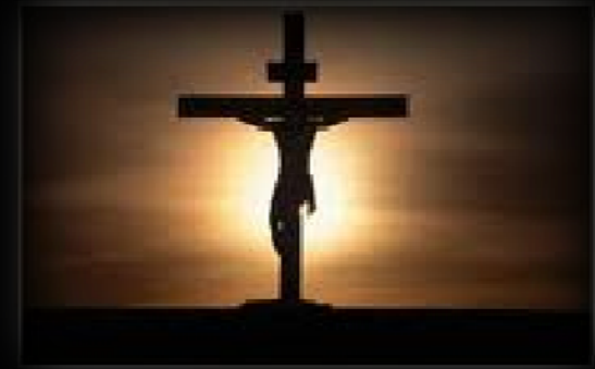
The Lamb of God